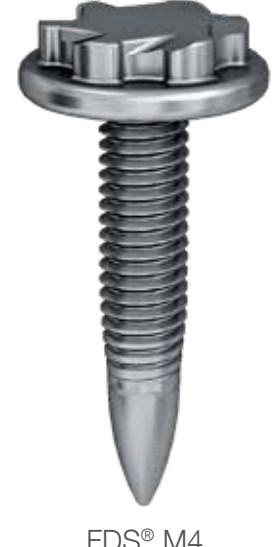
FDS® M4 High-Strength